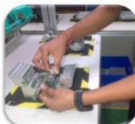
Comp. kit assy.