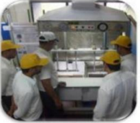
Water leak test