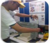
Cap filter fitting