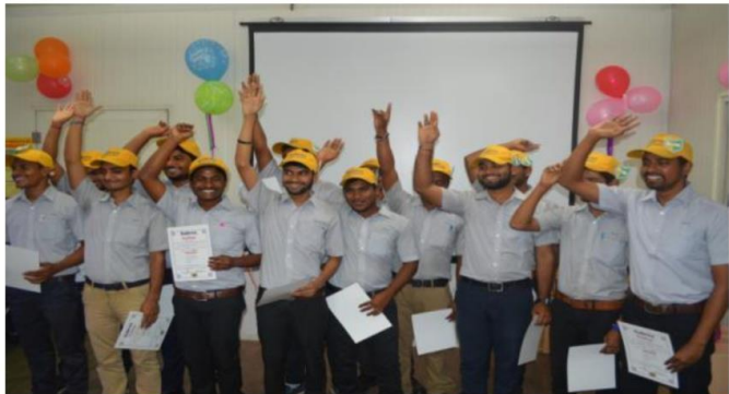
Successful Completion of Batch